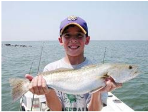
Submitted by Dan Arzonico