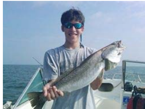
Submitted by Dan Arzonico

SPORTSMAN CHANNEL: Launched in 2003, Sportsman Channel is the only television and digital media company fully devoted to the more than 82 million sportsmen in the United States, delivering entertaining and educational programming focused exclusively on hunting, shooting and fishing activities. Sportsman Channel is now available in HD. Check with your local cable or satellite provider.